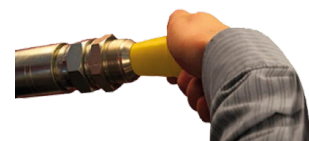
3. Push & Twist