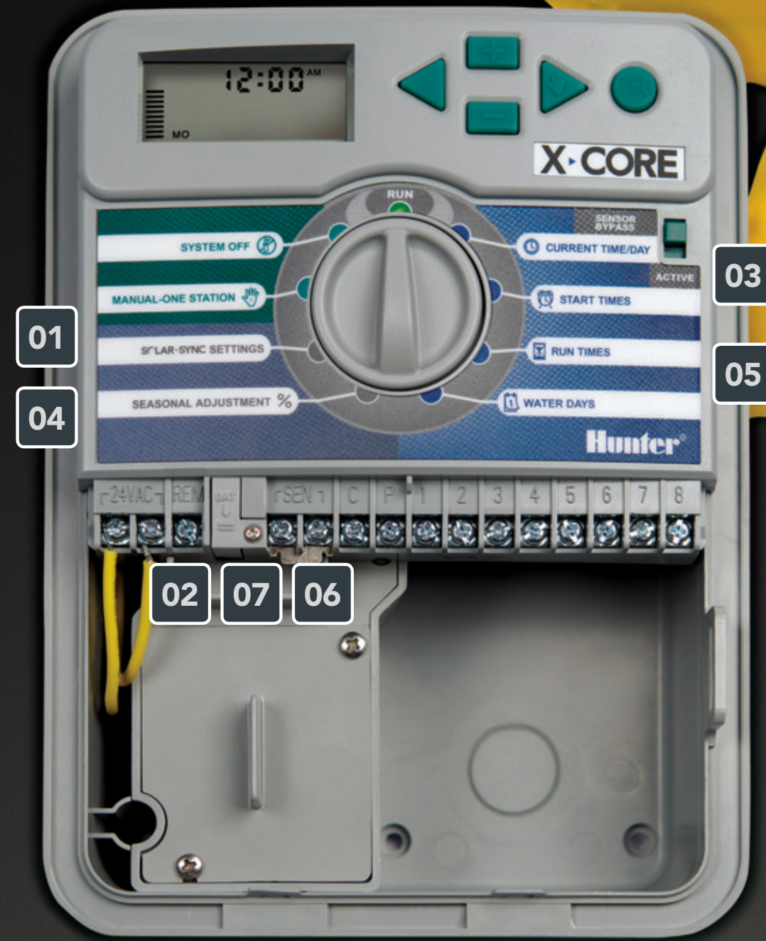
Indoor and outdoor models available

ADDED Remote control ready. Compatible with Hunter ROAM and ICR remotes.