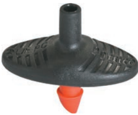
Pinch Drip™ PC 2 lph Barb 4 mm