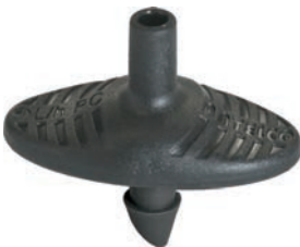
Pinch Drip™ PC 4 lph Barb 4 mm

* C v for all Pinch Drip™ emitters conforms to ISO 9261