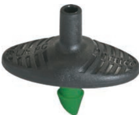
Pinch Drip™ PC 8 lph Barb 4 mm