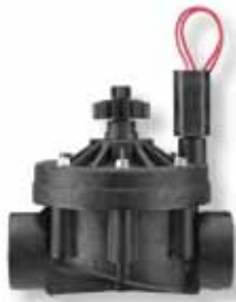
1½" (40mm) Globe