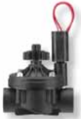
1" (25mm) Globe

The top-of-the-line valve you can count on for superior durability and ability to handle exceptionally high pressures