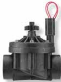
2" (50mm) Globe