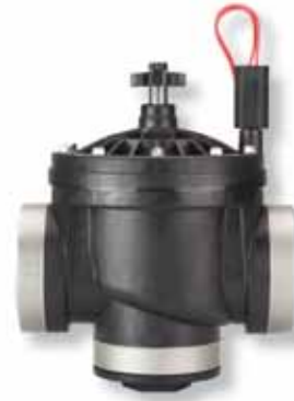
3" (80mm) Globe/Angle

F or a long-lasting valve that can deliver dependable performance at commercial sites, this is the heavy-duty workhorse you can count on. Created to handle the wide range of conditions different sites will bring, this valve includes both a fabric reinforced diaphragm and flow control as standard features, and can consistently withstand pressures of up to 1500 kPa