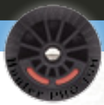
PRO-SPRAY FIXED ARC NOZZLES