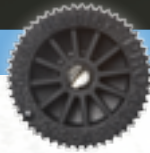
PRO ADJUSTABLE NOZZLES