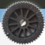
PRO ADJUSTABLE NOZZLES