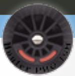
PRO-SPRAY FIXED ARC NOZZLES