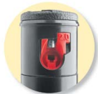
Nozzles self-align for easy installation and removal; marked for easy identification.