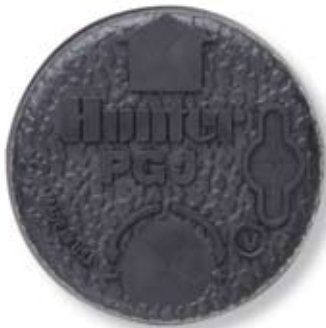
Heavy duty rubber cover keeps debris out of adjustment mechanism.