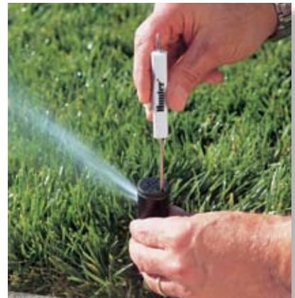
Easily fine-tune arc setting through the top of the sprinkler with screwdriver or Hunter wrench.

Note: All precipitation rates calculated for 180 degree operation. For the precipitation rate of a 360 degree sprinkler, divide by 2.