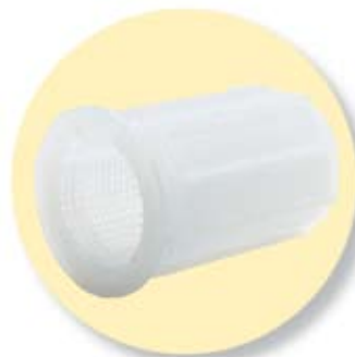
Extra large filter screen (the largest in its class!) traps more debris without clogging.